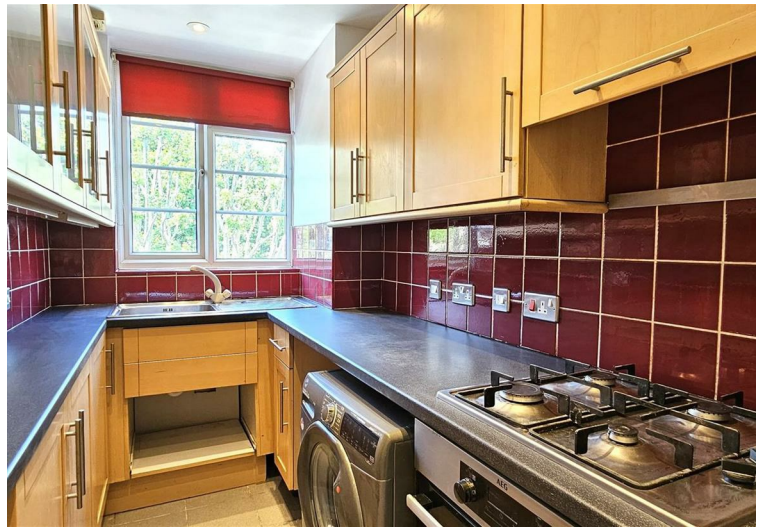
Greville Place, St Johns Wood NW6 £2,000 Per Month Unfurnished