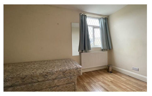
Large 4 Bedroom Townhouse! | Available Now | 2 Bathrooms | Private Balcony | Private Garden | Gas Central Heating | Spread Over 3 Floors | Council Tax Band C