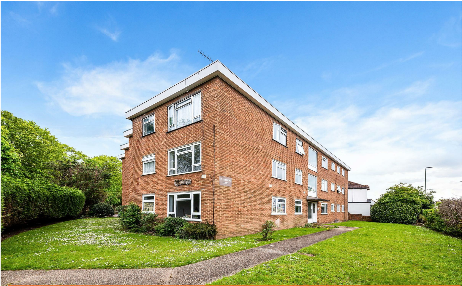
St Andrews Court, Sutton, SM1 SM1